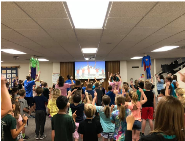
Community Vacation Bible School

Of the survey respondents, most participate in, in-person worship on Sundays, but about 25% participate online. We have a vibrant adult Sunday School, with approximately 1/2 of adults who attend church staying an additional hour for Sunday School, along with the preschool children who are eager learners in their Sunday School class. Many women participate in the Search and Grow monthly fellowship and study group. Several people are a part of the Stitches from the Heart group, who make knitted and crocheted items for local and global charities, and a small group of men meet weekly for Bible study with the pastor.