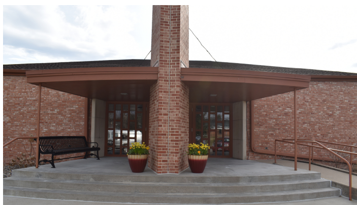
Current church building

Membership continued to grow, and the present building was constructed after the old church and parsonage were razed in 1956. It was the first building in Pella to be air-conditioned. Many improvements followed until 1990 when an expansion to increase the sanctuary capacity from 288 to 450 began with a total construction cost of $500,000. The first service following the remodel took place on Easter Sunday, March 31, 1991.