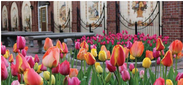
City of Pella Tulip Beds