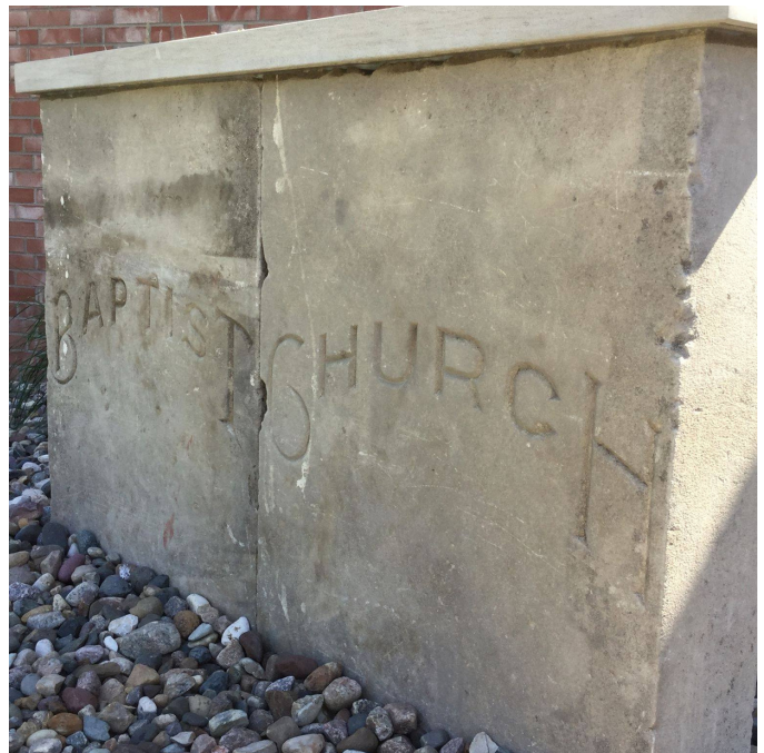
Original cornerstones from 1873 building outside current building

May the Lord make your love increase and overflow for each other and for everyone else.