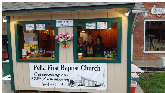
Vetbollen Stand at Tulip Time