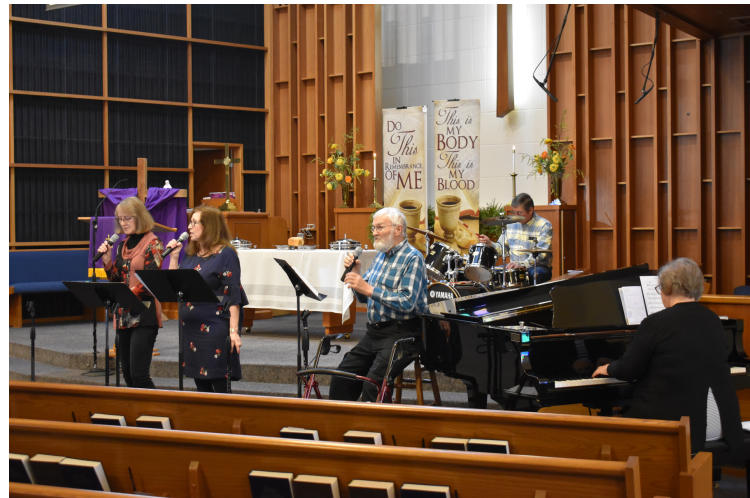
Time of Worship

The congregation is looking for a pastor who builds empathetic relationships with the membership, who will share in the joys of life, and will offer compassionate understanding during the difficult times of life. Along with building relationships, we desire a pastor who fosters a caring atmosphere and helps people to feel loved, accepted, and a part of who we are. Effective communication of ministry vision and decisions made in the church is also an important quality for our new pastor to possess.