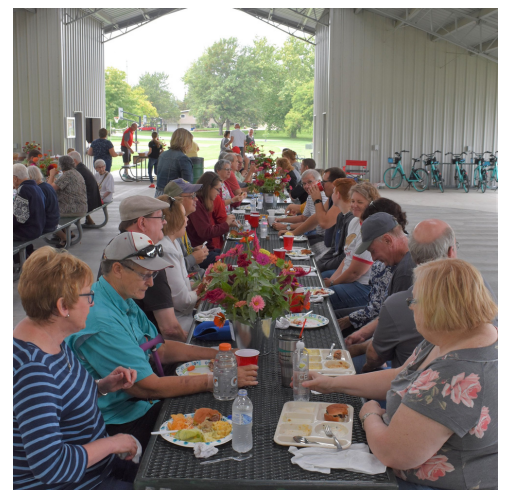
Annual Church Picnic