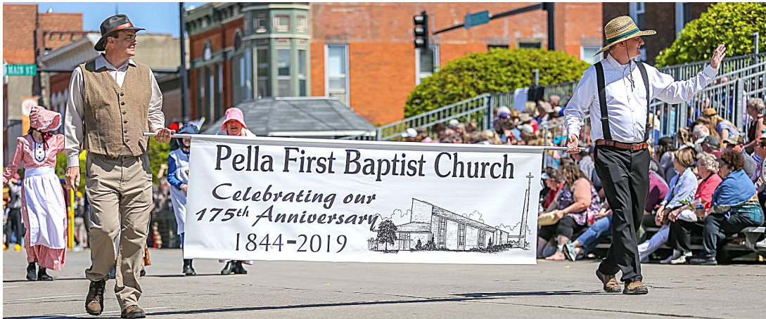
Celebrating 175 years of God's Faithfulness

Small enough to know you, big enough to care!