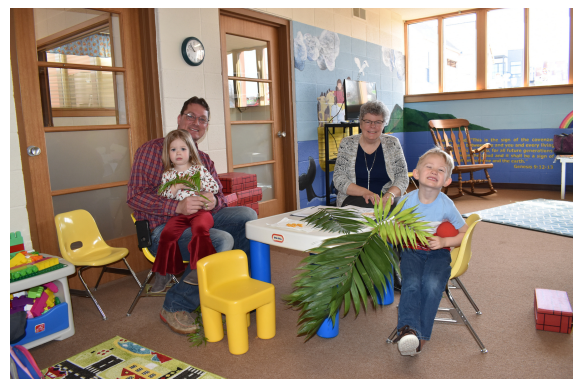
Children's Sunday School