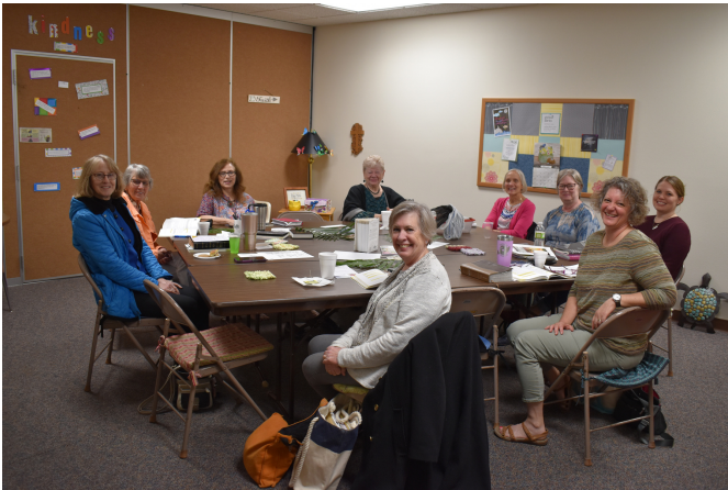
Women's Sunday School Class

We believe we are missionary people who respond to the constant appeal to win converts for Christ, provide support for medical and educational assistance, and attempt to change unjust conditions.