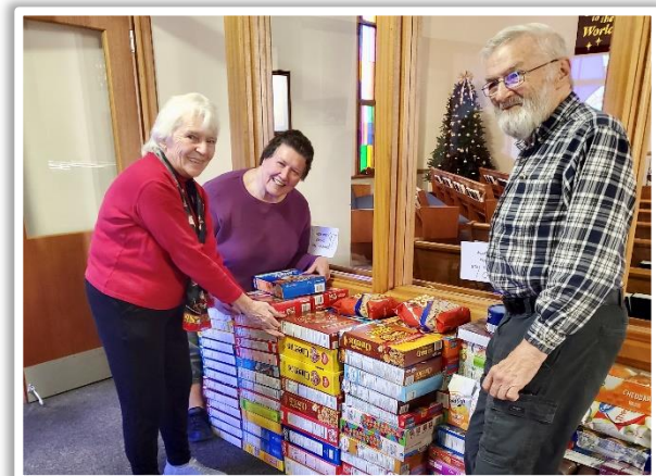
...More than we could ask or think! For The Well Food Shelf. Eph. 3:20